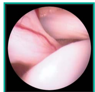
Normal cruciate ligament as seen through an arthroscope